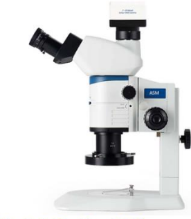
Digital & Optical Microscopes