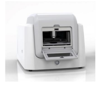
Research Auto Slide Scanner

High & Ultra-High Resolution Video Microscopes