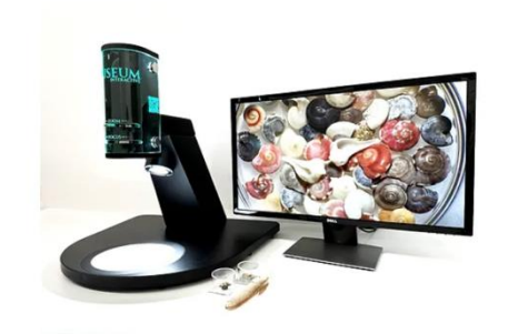
UHD/4K Zoom Video Microscope