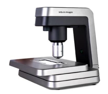
Compact Auto Slide Scanner